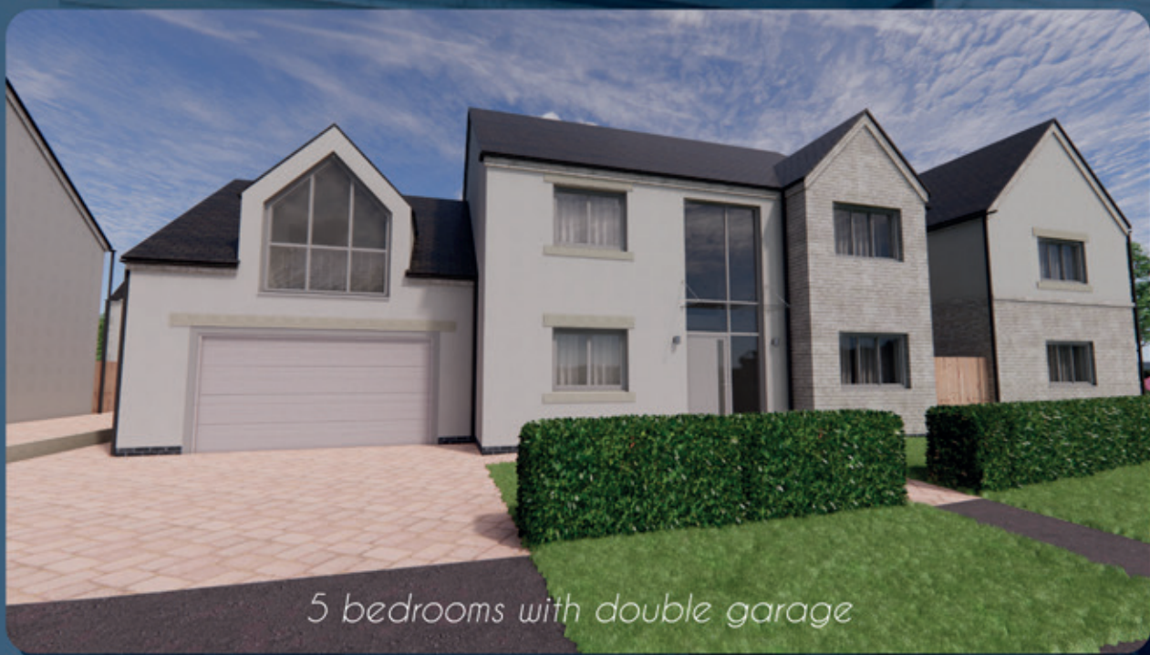
5 bedrooms with double garage

This traditional masonry new build offers a modern living accommodation featuring a natural stone and render finish.